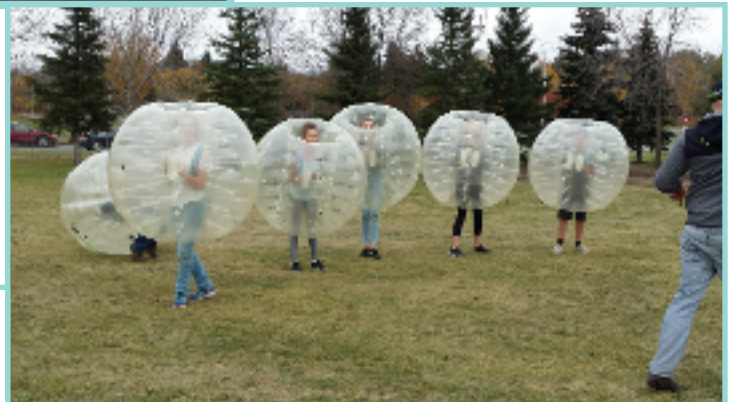
ACL class playing Bubble Soccer!