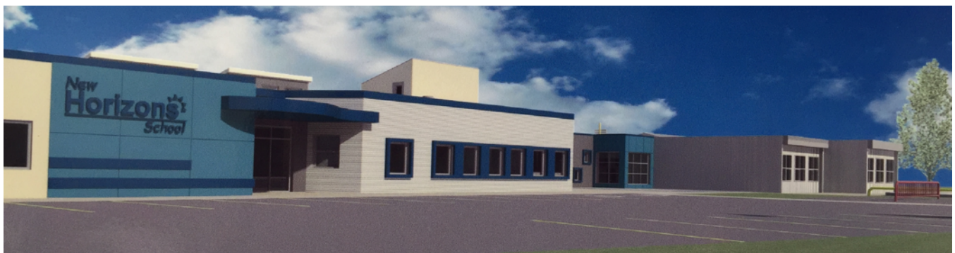
Front of School

Note the widened hallway entrance from the main entrance (the garage door and side door on the left will not be added).