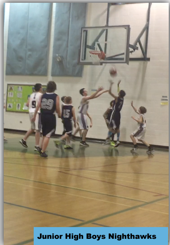
Junior High Boys Nighthawks