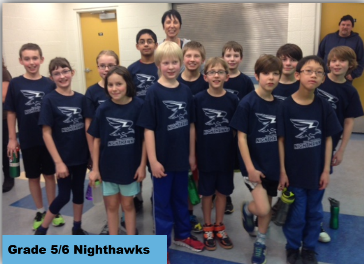
Grade 5/6 Nighthawks