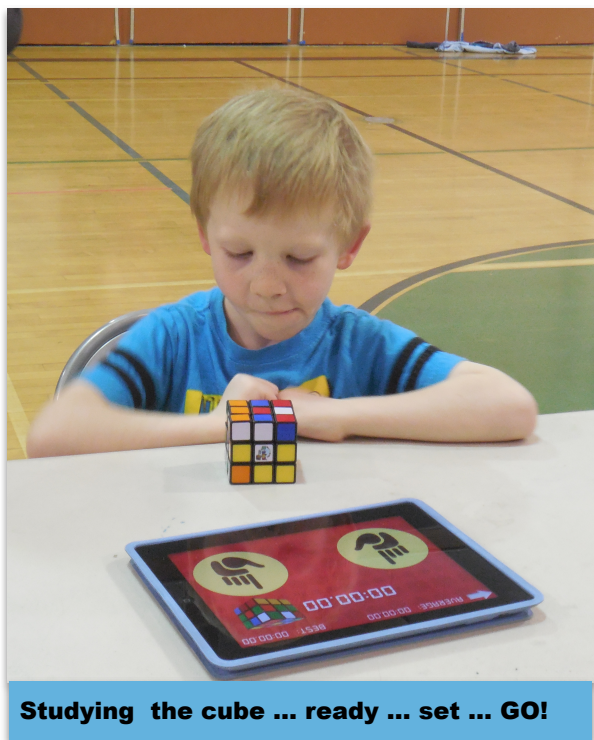
Studying the cube ... ready ... set ... GO!