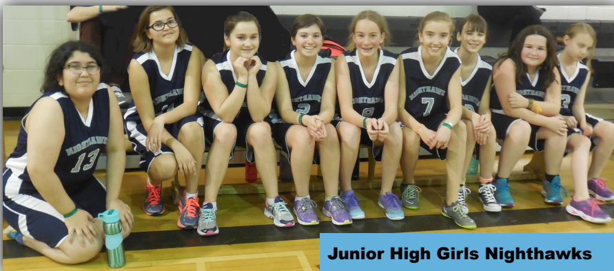
Junior High Girls Nighthawks