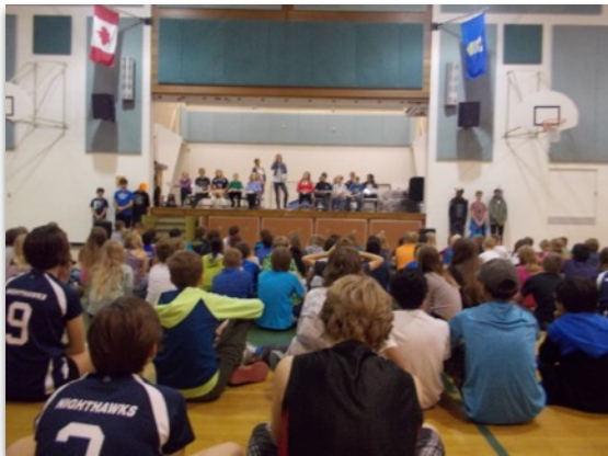
Student Council Election: Speeches

On Thursday, September 24, students from Grades 4-9 were directly involved in an election - our Student Council election.