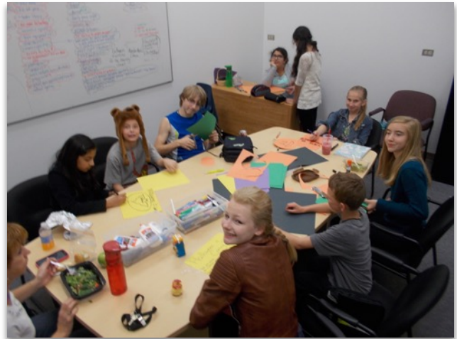
NHS Student Council

Each of the classes from grade 4-9 also elected their own room representative to be on the Student Council.