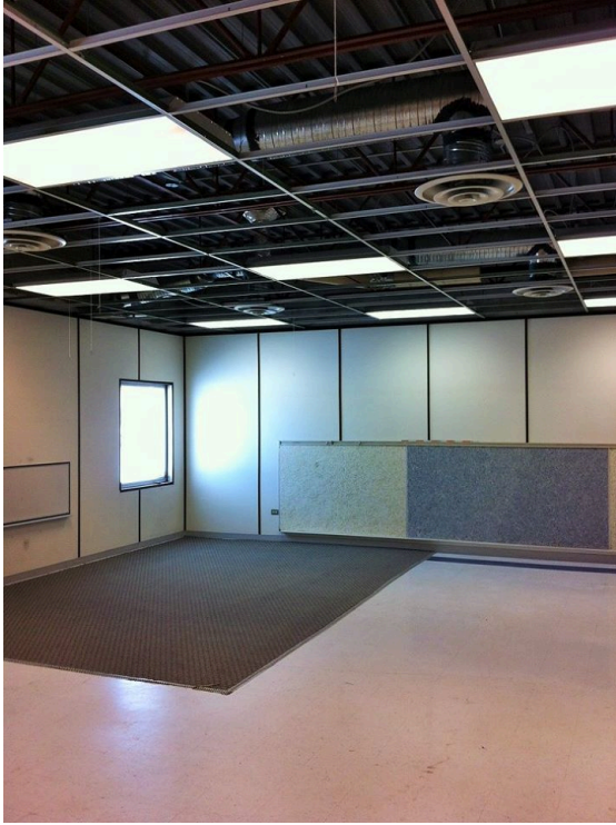
One of the classrooms.

The asbestos abatement portion of our new school's upgrades is now complete. Other renovation projects will continue through the spring!