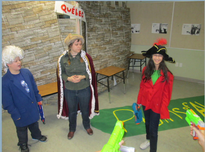
Wolfe and Montcalm prepare to deliver their speeches.