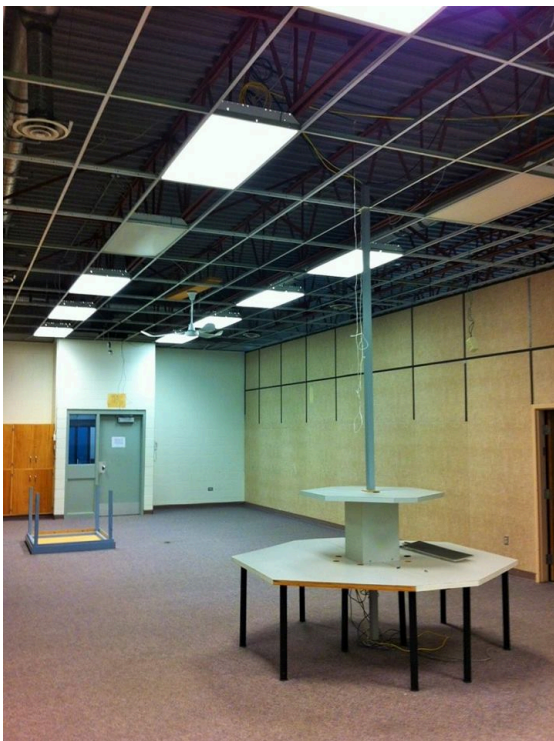
The Learning Commons (Library)